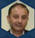
Senator Dr. Musadik Malik Advisor to Prime Minister of Pakistan